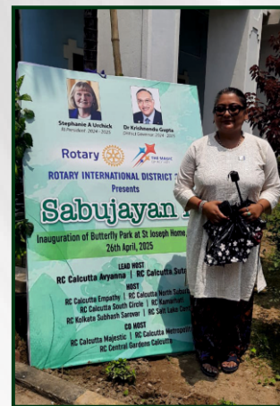
District Project "Sabujayan" Our Club participated as a Host

We provided full support for finishing of the New Campus partially about 1600 Sqft area like Construction, internal Plastering & Painting, providing Aluminum Doors & Windows with G.I. Grills, Flooring, internal Electrification, providing required nos of fully furnished toilets, kitchen, storerooms and dormitories for inmates etc including outside septic tank, water distribution and sewage disposal system etc complete for a total cost around Rs. 16.5 lakhs generously contributed by the members of our RC Salt Lake Central .