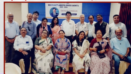
Face to face open discussions between District Governor (2025-26) with Presidents (2025-26) of Zone 8 at Prakash Bhawan on 10th May 2025